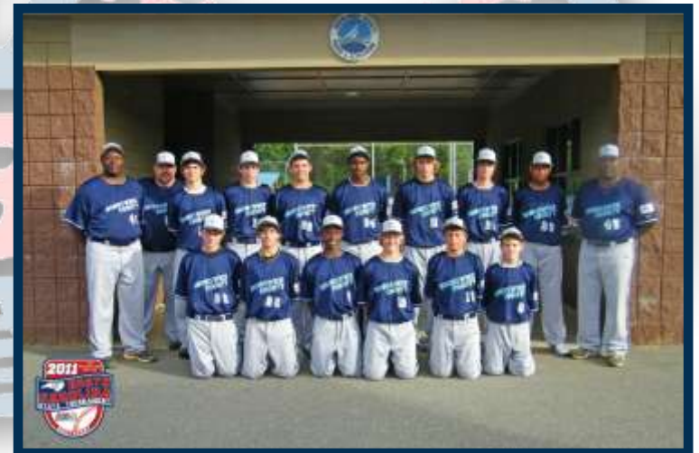
Brunswick County 13-Year-Old All-Stars

Do not worry if your District Tournament is not completed, go ahead and send Team Picture with names. Example to the right: