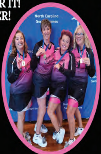
2024 STATE FINALS GOLD MEDAL WINNERS

Now Recruiting Members for the 2025 season!